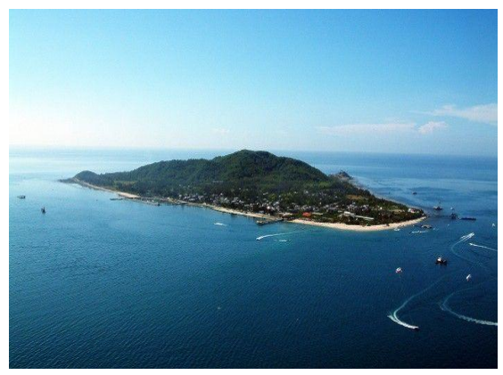
Line 2: Second day: Yanuoda rainforest and Dadonghai gulf (Sanya)

Total cost: around 63 USD/400 RMB (includes main entrance tickets and travel fees)